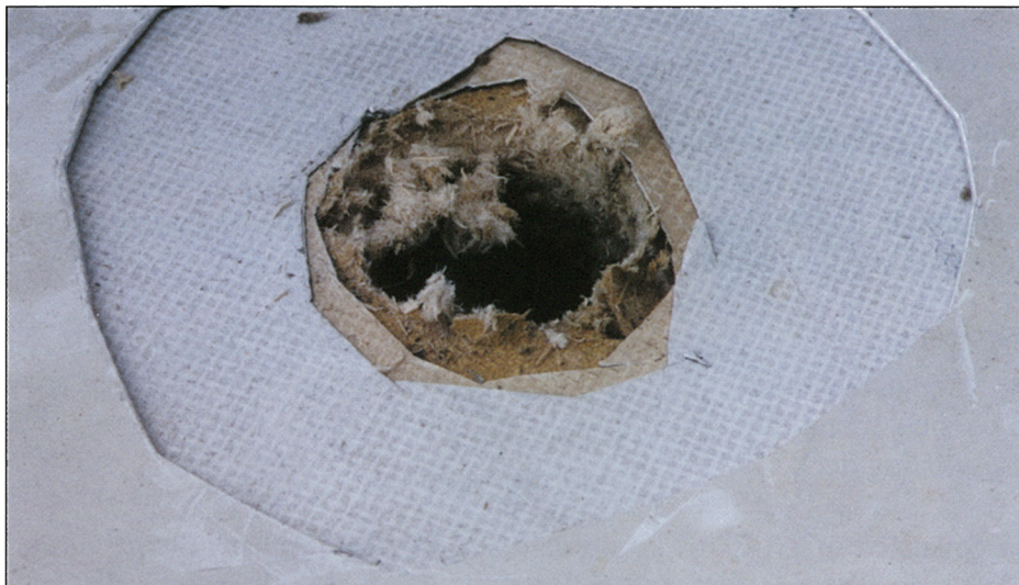
Cuts were made through the new membrane, existing Hypalon membrane and insulation, down to the vapor barrier.

Cuts were made through the new membrane, existing Hypalon membrane and insulation, down to the vapor barrier over the existing deck.