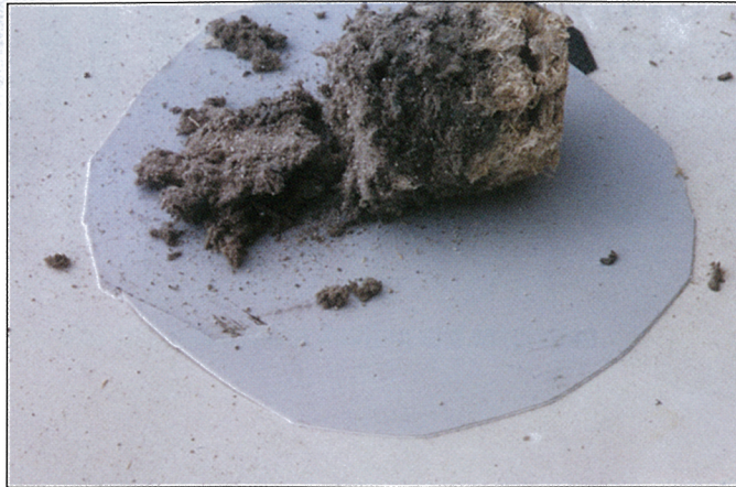
Core cuts show dry insulation.