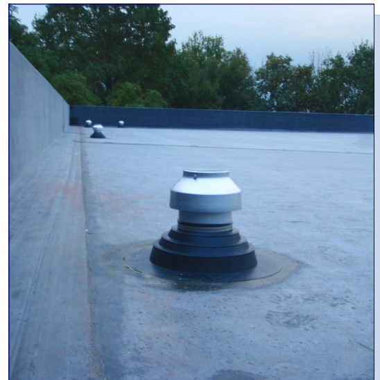
The 2001 Co patented valves hold the membrane down with the power of the wind.

In 2006, the main section of their World HQ's roof needed replacement. DA turned to the premium commercial roof provided by the 2001 WVRS . Not only were we able to provide their building with the industry's highest-performing roof system, but due to the unique capabilities of the 2001 WVRS they were able to realize significant savings by re-roofing directly over the existing, failed membrane. That roof section performed so well, DA had the 2001 WVRS installed over the remaining section in 2011.